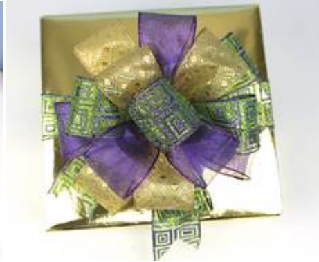
Figure 31 & Figure 32

This is an example of a different Style bow. Place center Finger on row B. Then the other Fingers on row C – 1 wrap each. This will give a much smaller center loop creating a very different Style of bow. Enjoy!