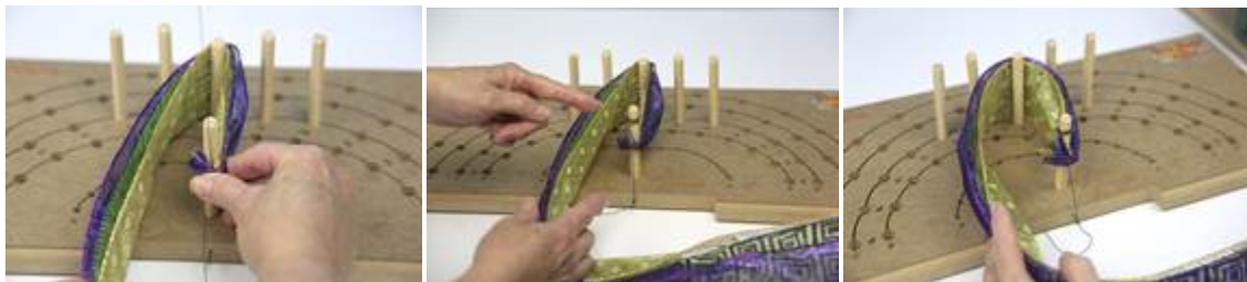
Figure 12, 13 & 14

Notice how I have gone around center finger from the left and then pulled the ribbon downward to base finger. Notice I have kept 1 piece of wire up and one wire down. Pinch the wired ribbon on the “pinch” to the base finger. Do Not push the pinch all the way down to the hand. Go up the base finger to half the width of the ribbon you are using. I am using 2-½ inch ribbon so I am up the base finger 1-¼ inches. Continue holding pinch in place with Right Hand. With Left Hand pull wire up base finger then wrap around top of finger. To start wrap go left and go around back of base finger then continue wrapping. Leave just a tiny tip sticking out so you can get to the wire at the end of bow making. Now holding pinch in place with Left Hand, pull the downward wire with Right Hand and go around nail just once and stick all of the wire under the board, leaving a small loop so you can also get to this piece of wire at the end. This is how your work should look at this point. The ribbon firmly wired in place to the hand. Figure 12, 13 & 14