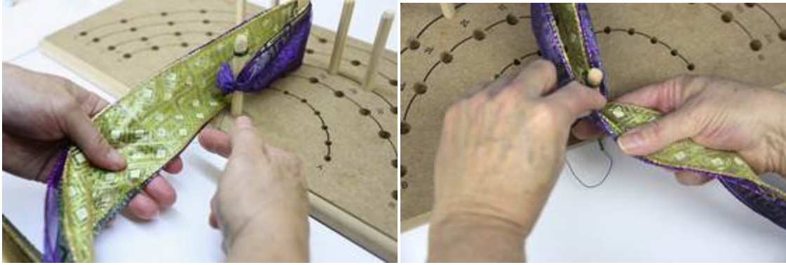
Figure 15 & Figure 16