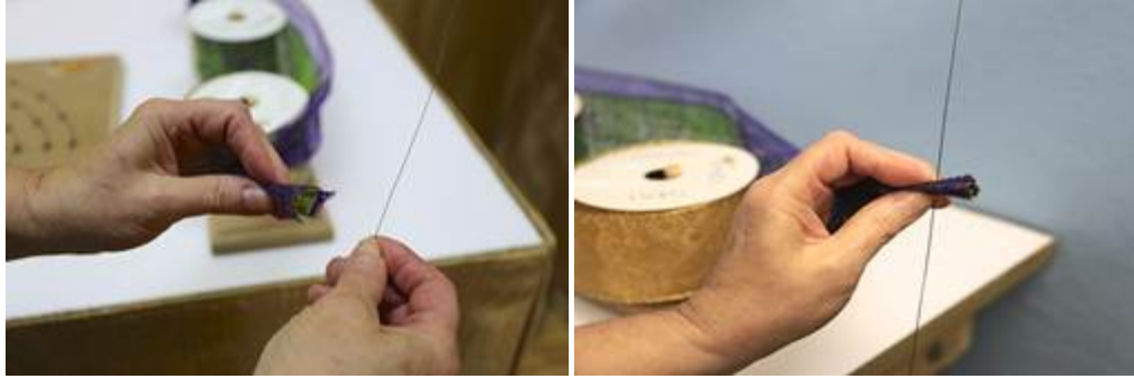
Figure 7 & 8